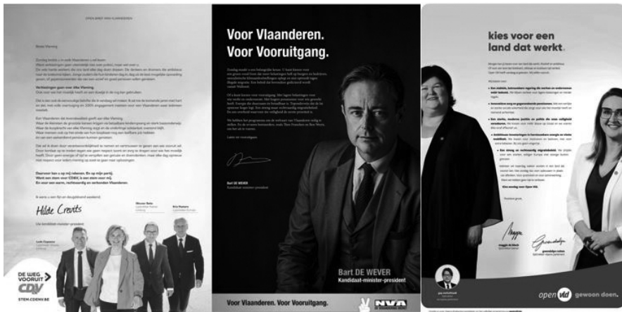
Figure 3 Examples of letter style, broad-based newspaper ads (left: CD&V; middle: N-VA; right: Open VLD)